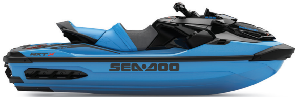
● NEW Gulfstream Blue Premium