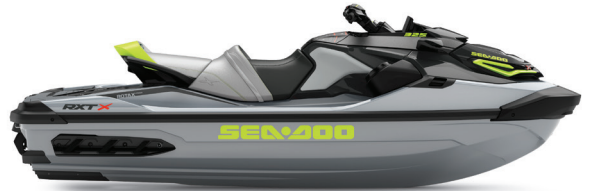
● Ice Metal and Manta Green