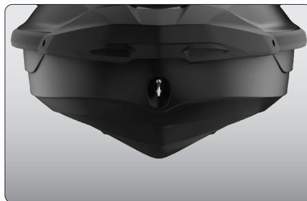
GTI Hull This moderate V-shaped hull guarantees a stable, enjoyable ride in variable water conditions. Confident, predictable handling but incredibly playful when you want it to be.