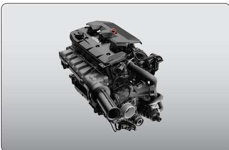
Rotax 1630 ACE - 230 Engine This powerful engine comes standard with a supercharger and external intercooler.