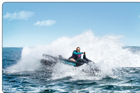
VTS (Variable Trim System) Provides handlebar-activated settings so riders can easily find the ideal trim for varying conditions.