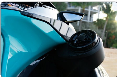
BRP Audio - Premium System (optional) A factory-installed, truly waterproof Bluetooth* audio system for an extra dose of fun and entertainment on the water.