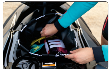
Large Front Storage An impressive 38 gallons of sealed storage space allows riders to safely stow belongings while riding. 1